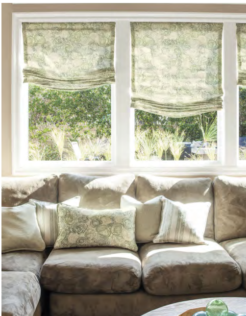
Fabric Shades with Motivia Motorization Remote

Yes. Simply unplug the battery pack and replace with a DC charger. The charger will connect your shade to a nearby outlet in your home.