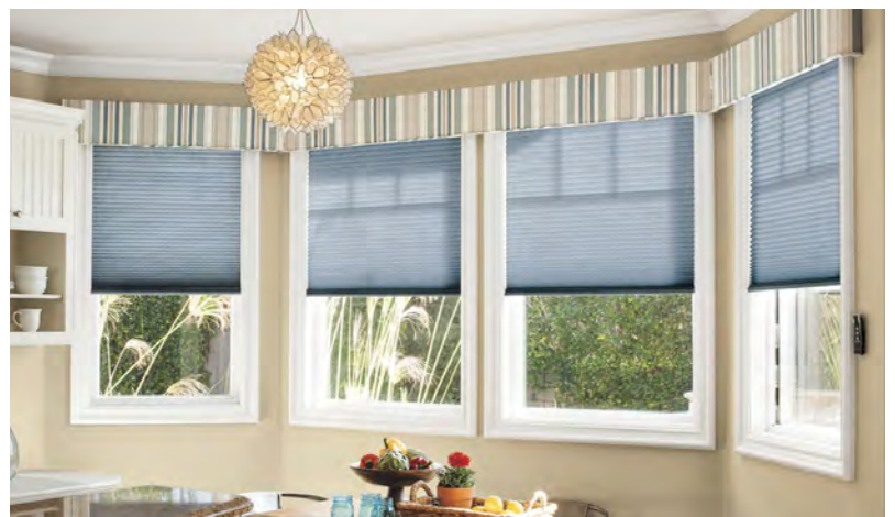
Fabric Cornices and Honeycombs with Motivia Motorization Remote