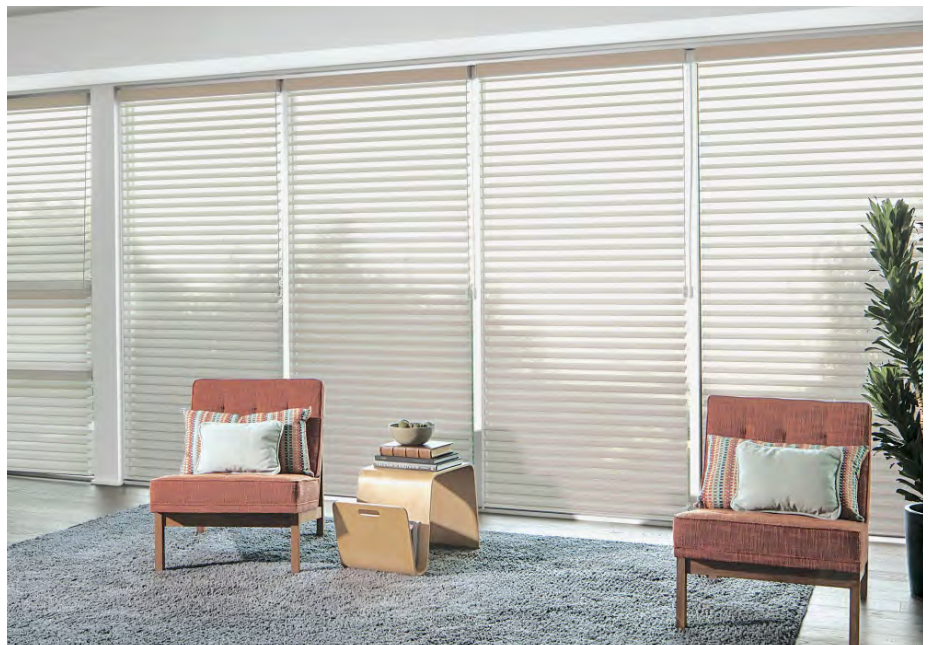
Sheer Shades with Motivia Motorization Wand