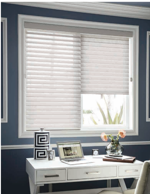
Sheer Shadings with Motivia Motorization Wand

Yes. Simply unplug the battery pack and replace with a DC charger. The charger will connect your shade to a nearby outlet in your home.