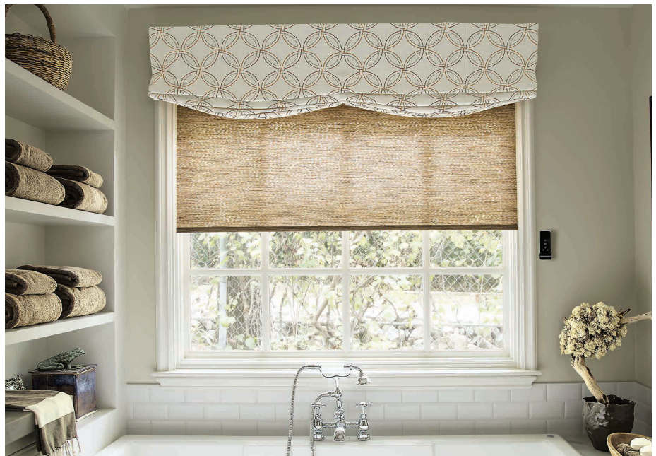
Roller Shade with Motivia Motorization Remote layered with Relaxed Fabric Valance