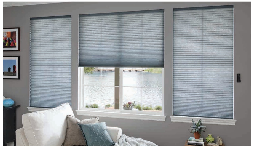
Luxe Linen Honeycomb with Motivia Motorization Remote